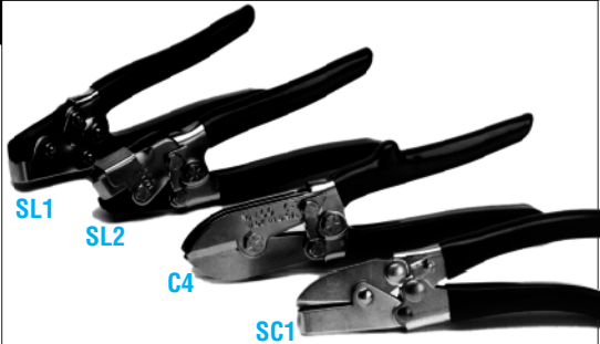
SL1 SL2 C4 SC1